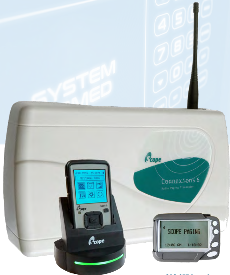
EPOC-S Responder in charger*