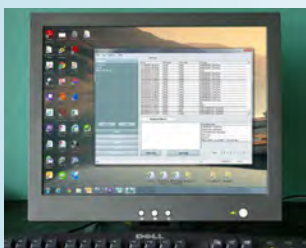
Connex Page / LAN