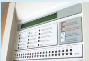
Fire / Security / Nursecall